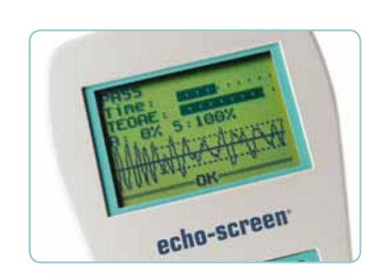
Automated TEOAE PASS Result